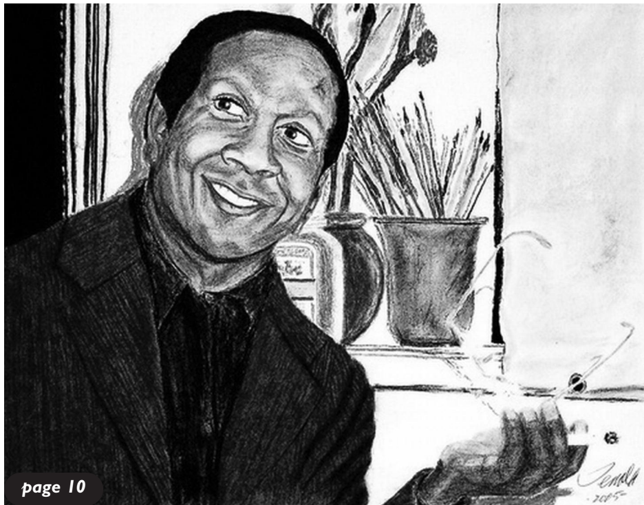
Artwork by Tenola Gamble Safe Streets Arts