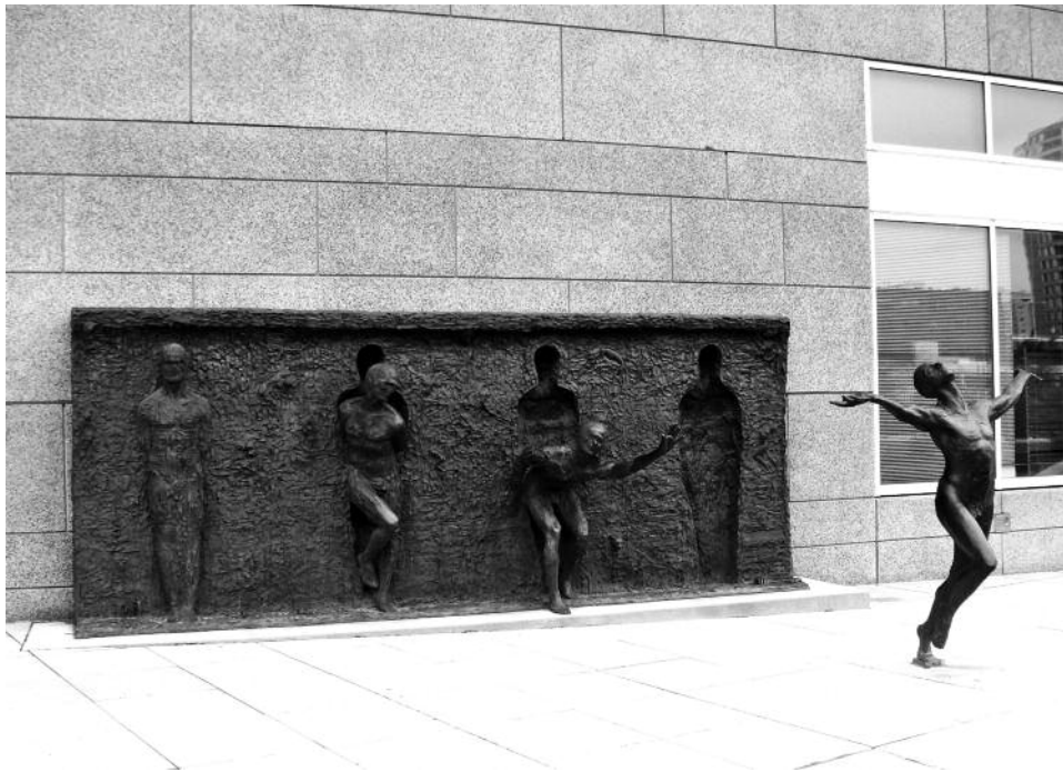
Freedom , by Zenos Frudakis, located at 16th and Vine Streets, Philadelphia, PA. Freedom, according to the artist, embodies the "universal desire with almost everyone; that need to escape from some situation – be it an internal struggle or an adversarial circumstance, and to be free from it."

Take a chance and jump on this opportunity to educate yourself and make a positive difference in your life. Remember this: don't sell yourself short. It never hurts to try something new to keep you moving forward for the betterment of your life. Bettering yourself can also improve and enrich the community that you're coming home to. You can do it. Climb the ladder to a successful way of learning and living. Strive to keep those walls from closing in on you and to strengthen your mind.