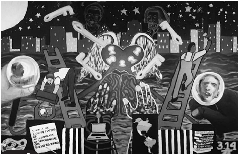
Picturing Our Dreams, created by incarcerated youth at Monroe Correctional Facility and the New York State Literary Center.